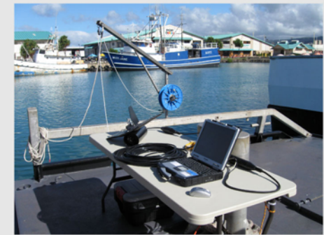
Clean Islands Council's C3 based SMART Package

With its compact size, ease of operation, and enhanced data handling capabilities, the Turner Designs C3 Submersible Fluorometer shows potential as a next generation instrument for SMART tier II and tier III monitoring. Clean Islands Council will continue to work with the oil spill response community in evaluating in-situ fluorometry as applied to the SMART protocol.