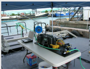
Clean Islands Council's 10-AU based SMART Package.

In early 2000, after developing a comprehensive dispersant application program, CIC in conjunction with our member companies and partners, invested in a SMART monitoring program. CIC obtained a Turner Designs 10-AU Fluorometer and adopted the SMART model as developed by NOAA and and USCG National Strike Force. Over the next several years, CIC made numerous improvements to the original package, which included integrating a laptop computer to give the operator real-time data display, data logging, and live GIS mapping capabilities. Though CIC currently has a fully operational SMART program, the complexity of the core instrument, the 10-AU Fluorometer, demands an inordinate amount of effort to operate and maintain.